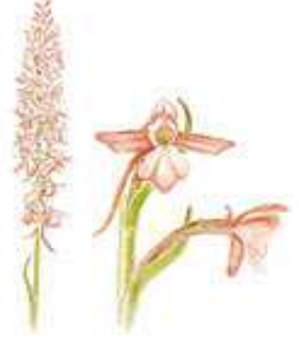
Fragrant orchid (Gymnadenia conopsea)