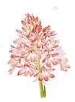
Pyramidal orchid (Anacamptis pyramidalis)